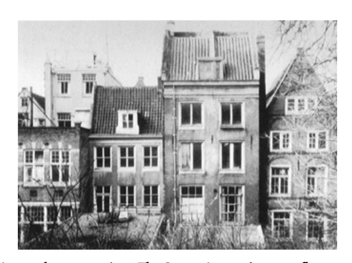
263 Prinsengracht, Amsterdam, rear view. The Secret Annex (top two floors and attic) as seen from the courtyard garden.