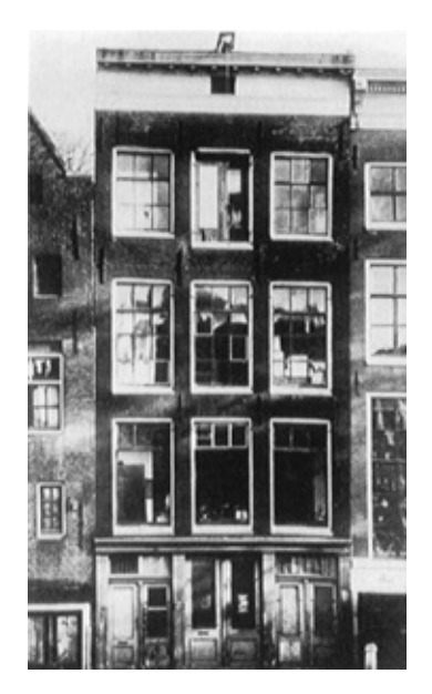
263 Prinsengracht, Amsterdam, front view.